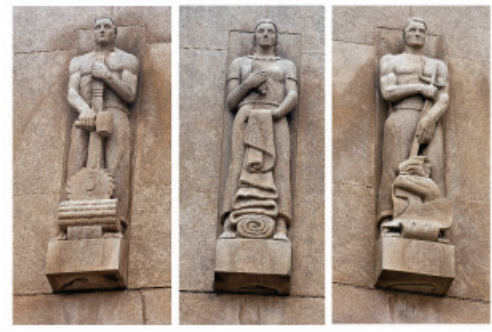
Furniture, textile, and agricultural workers on the front of the Guilford County – High Point Courthouse of 1938

During the 1920s, this style enjoyed its most glorious expression. This decade produced such lavish examples at the Chrysler Building and Rockefeller Center in New York City. However,