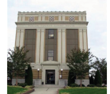
Person County Courthouse, 1930