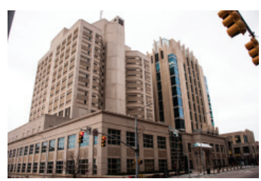
Wake Justice Center, 2013

Leadership in Energy and Environmental Design (LEED) is a system of ratings developed by the U.S. Green Building Council to set standards for certification in the design, construction, and operation of "green" buildings. Many designers pursue LEED certification, and if local governments can afford the up-front investment, a LEED certified building can save money over the lifespan of a building.