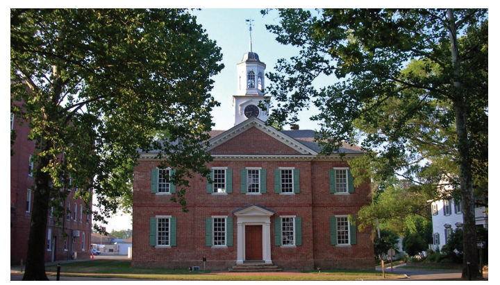
Chowan County Courthouse, 1767