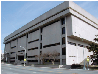
Guilford County, 1974