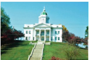
Jackson County, 1914