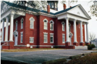
Carteret County, 1907