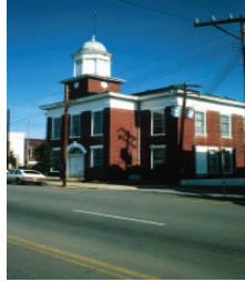
Granville County, 1838