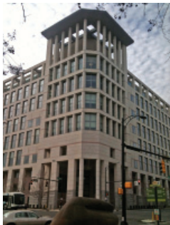
Mecklenburg County, 2007