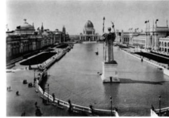
World's Columbian Exposition, Chicago, 1893

After experimenting with the flamboyant styles of the Victorian era, Americans began to desire a return to more classical styles. The 1893 World's Columbian Exposition in Chicago celebrated the arrival of Christopher Columbus in the New World, and Neo-Classical buildings were constructed for the fair. Because of this, the Columbian Expo is credited with being the inspiration for the return of classicism in architecture. This is also known as the Beaux Arts period in architecture, which encompasses Baroque and Italian Renaissance elements, but the American version of Beaux Arts focuses mainly on the ancient Greek style. Many American architects took their training at the Ecole des Beaux Arts in Paris, returning home with an academic understanding of classical proportions and ratios in design.