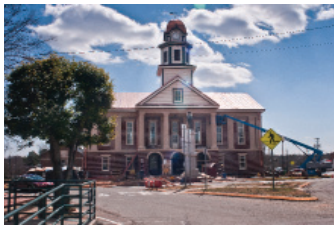
Chatham County 1881 Courthouse reconstruction