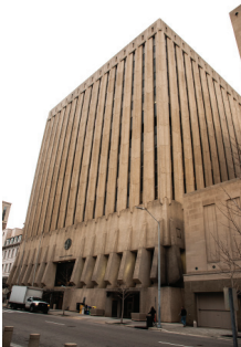
Wake County, 1969