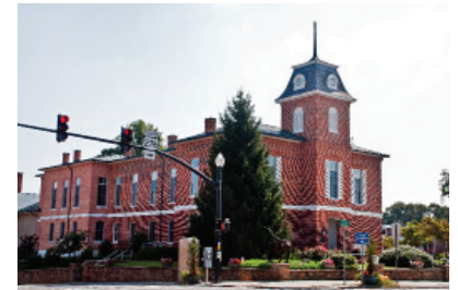
Transylvania County, 1873