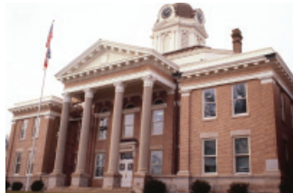
Halifax County, 1909