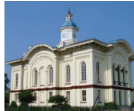
Caswell County, 1861