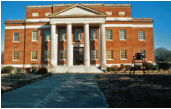
Greene County, 1935