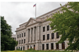
Guilford County, 1918