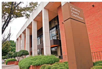
Cabarrus County

There are different variations on modernist architecture, including the glass and steel International style towers that reach to the sky. But the form of modernism that North Carolina courthouses followed from about 1950 to 1980 is referred to as “Brutalist.” Brutalism is named for the French term “beton brut,” which means “raw concrete.”