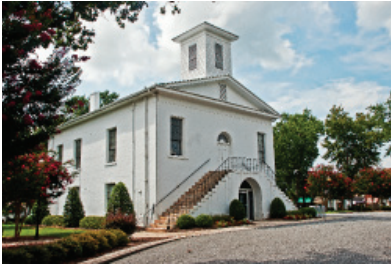
Gaston County, 1847