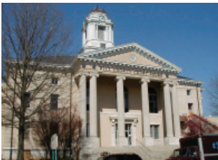
Pitt County, 1910