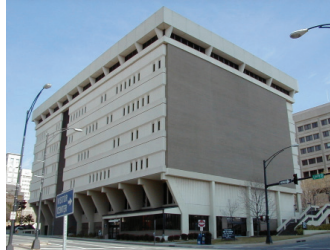
Forsyth County, 1972