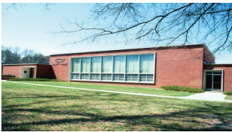
Hertford County, 1956