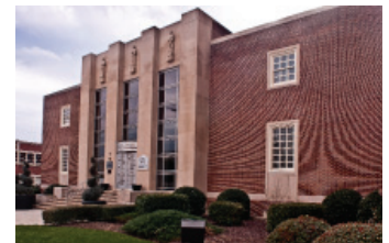
Guilford County - High Point 1938