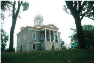
Burke County, 1835