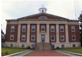
Jones County, 1938