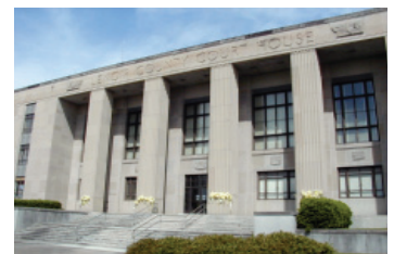
Lenoir County, 1939 (NCAOC file photo)