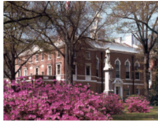
Pender County, 1936