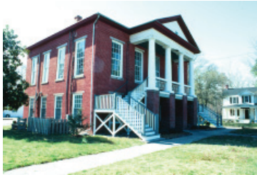
Camden County, 1847