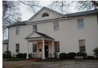
Perquimans County Courthouse, 1825