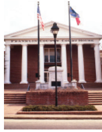
Franklin County, 1850