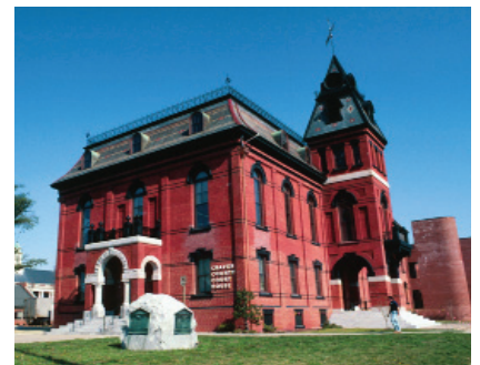
Craven County, 1883