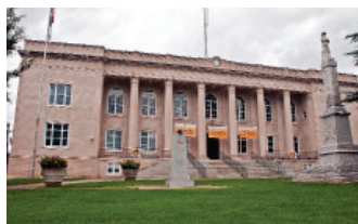
Rutherford County, 1925

After experimenting with the flamboyant styles of the Victorian era, Americans began to desire a return to more classical styles. The 1893 World's Columbian Exposition in Chicago celebrated the arrival of Christopher Columbus in the New World, and Neo-Classical buildings were constructed for the fair. Because of this, the Columbian Expo is credited with being the inspiration for the return of classicism in architecture. This is also known as the Beaux Arts period in architecture, which encompasses Baroque and Italian Renaissance elements, but the American version of Beaux Arts focuses mainly on the ancient Greek style. Many American architects took their training at the Ecole des Beaux Arts in Paris, returning home with an academic understanding of classical proportions and ratios in design.