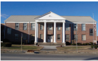
Pamlico County, 1936