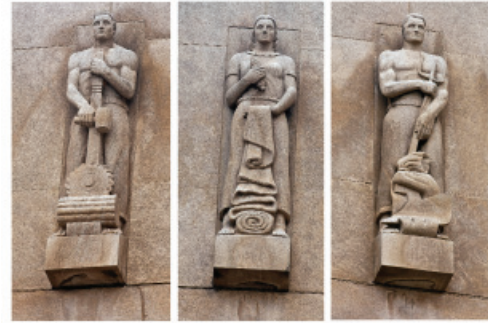
Furniture, textile, and agricultural workers on the front of the Guilford County—High Point Courthouse of 1938

During the 1920s, this style enjoyed its most glorious expression. This decade produced such lavish examples at the Chrysler Building and Rockefeller Center in New York City. However,