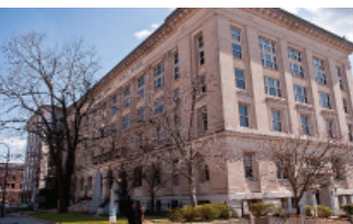
Durham County, 1916