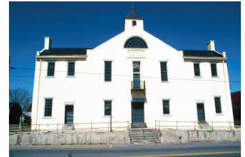
Gates County Courthouse, 1836

The courthouses in North Carolina built in the Federal style that still remain are the Perquimans County and the Gates County Courthouses, built in 1825 and 1836. They feature plainer wall surfaces than in the Georgian style, with detail isolated in panels, tablets, and friezes.