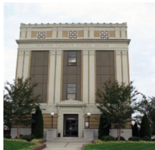
Person County Courthouse, 1930