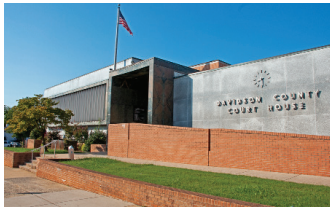
Davidson County, 1959