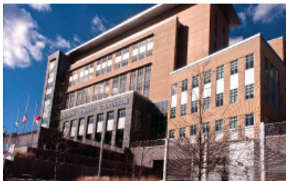
Durham County, 2012