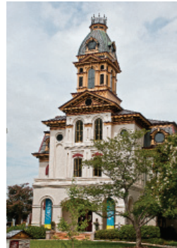
Cabarrus County, 1876