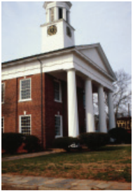
Orange County, 1845