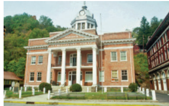
Madison County, 1907