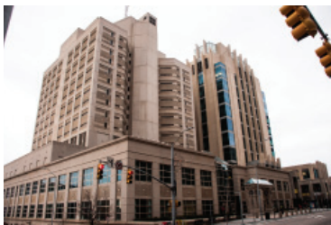
Wake Justice Center, 2013

Leadership in Energy and Environmental Design (LEED) is a system of ratings developed by the U.S. Green Building Council to set standards for certification in the design, construction, and operation of “green” buildings. Many designers pursue LEED certification, and if local governments can afford the up-front investment, a LEED certified building can save money over the lifespan of a building.