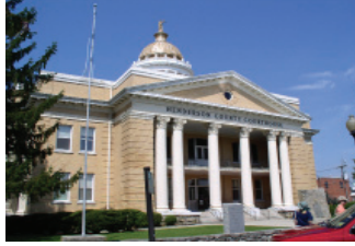
Henderson County, 1904