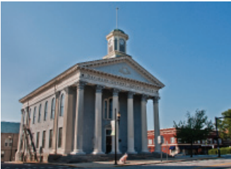
Davidson County, 1858