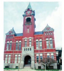
New Hanover County, 1892