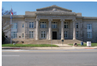
Rowan County, 1912