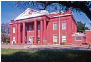
Lee County, 1908