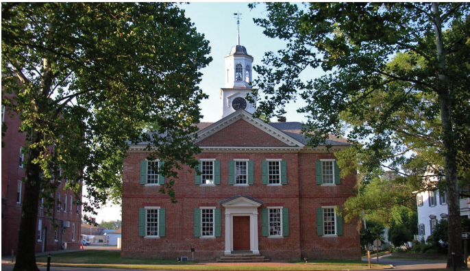
Chowan County Courthouse, 1767