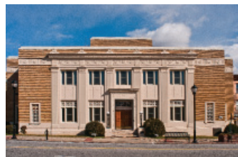
Caldwell County, 1929