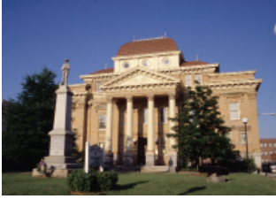
Iredell County, 1899