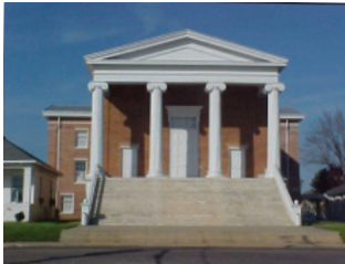
Northampton County, 1859