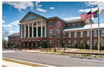
Chatham County Justice Center, 2012