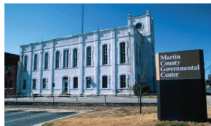
Martin County, 1885