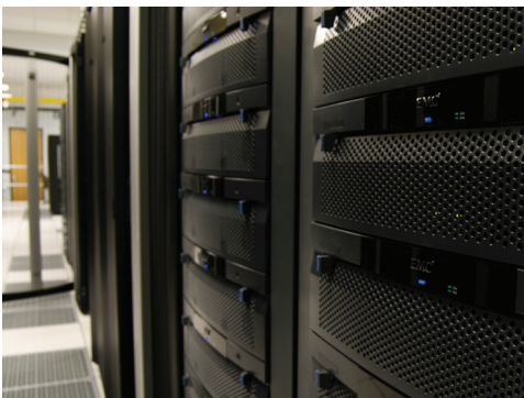
A small-scale server farm is the hub for network connectivity and data storage, and retrieval for court-related information.

The NCAOC Data Center includes, but is not limited to, two large enterprise system computers (traditionally known as mainframe computer systems). These large systems house and support all court legacy (e.g., ACIS) and web-based (e.g., NCAWARE) computer applications. Court data produced by these applications are stored and managed by this section for more than 121,000 potential users within the Judicial Branch, Executive Branch, and law enforcement. These large computer systems combined can execute more than 4.9 billion instructions per second, process more than 3.37 million production transactions per day, resulting in the hosting of 82 production applications. In addition to processing power, they provide storage management and backup of court data for disaster recovery and business continuity purposes. IOSS provides statewide users with a quality of service availability of more than 99 percent.