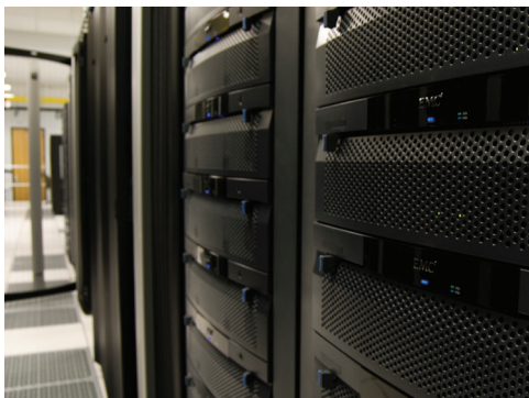
A small-scale server farm is the hub for network connectivity and data storage, and retrieval for court-related information.

The NCAOC Data Center includes, but is not limited to, two large enterprise system computers (traditionally known as mainframe computer systems). These large systems house and support all court legacy (e.g., ACIS) and web-based (e.g., NCAWARE) computer applications. Court data produced by these applications is stored and managed by this section for more than 121,000 potential users within the Judicial Branch, Executive Branch, and law enforcement. These large computer systems combined can execute more than 3 billion instructions per second, process more than 17.9 million transactions per day, and provide and support five additional environments for the development of court applications, resulting in the hosting of 450 total applications. In addition to processing power, they provide storage management and backup of court data for disaster recovery and business continuity purposes. IOSS provides statewide users with a quality of service availability of more than 99 percent.