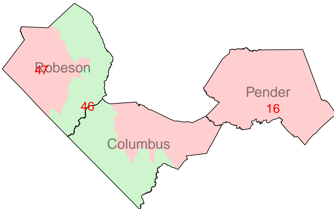
2017 Enacted House Plan Districts (3 Districts)