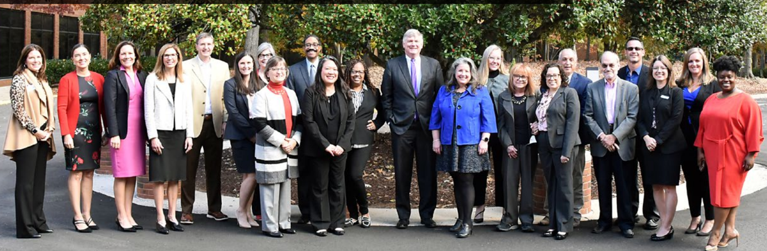
2022 Equal Access to Justice Commission members, special advisors, and staff

The Commission's Pro Bono Resource Center tracked over 60,000 pro bono hours reported by North Carolina attorneys in 2022. Join us in the pursuit of equal access to justice.