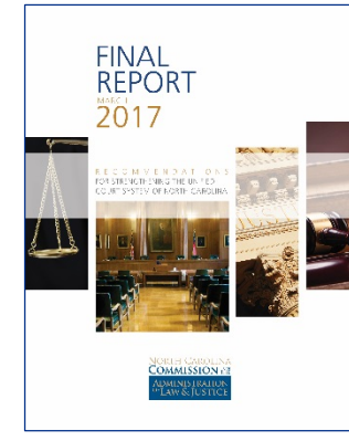
NCCALI FINAL REPORT

They need a website that's accessible and user-friendly, so we're completely redesigning the NC Courts website, and we plan to unveil the new website by next summer.