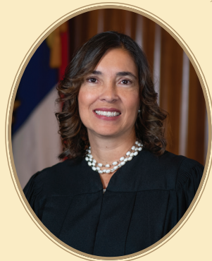
ASSOCIATE JUSTICE ANITA EARLS

Reception Immediately Following Ceremony NORTH CAROLINA STATE CAPITOL 1 EAST EDENTON STREET, RALEIGH, NC 27601